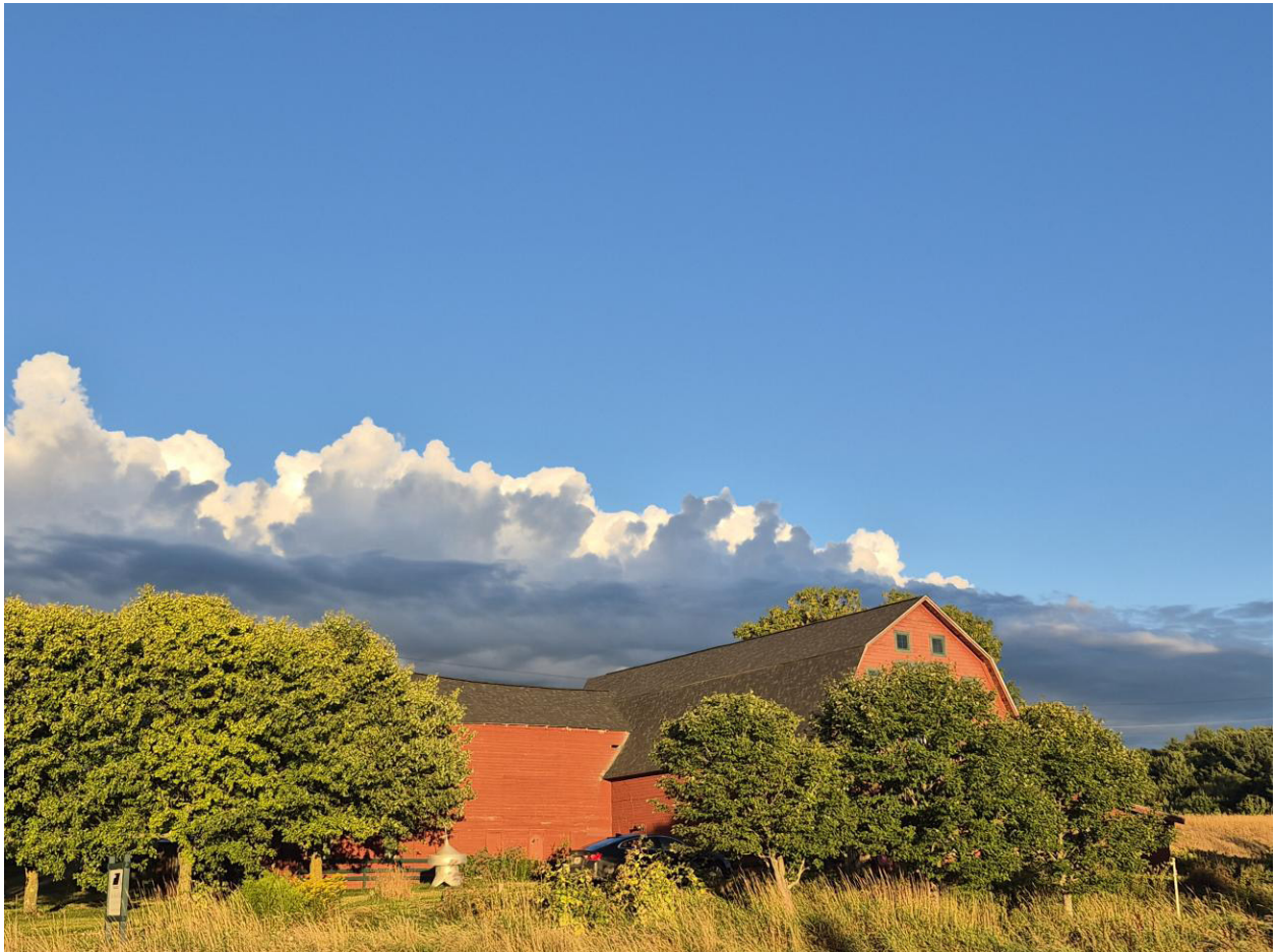
"Before It Rains" by Sophia Brooks, Essex Junction, VT